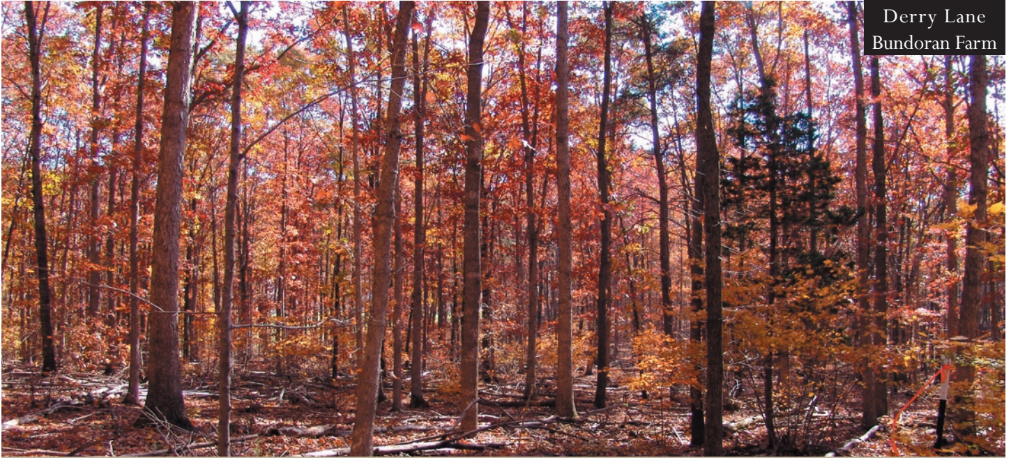
View South to Homesite